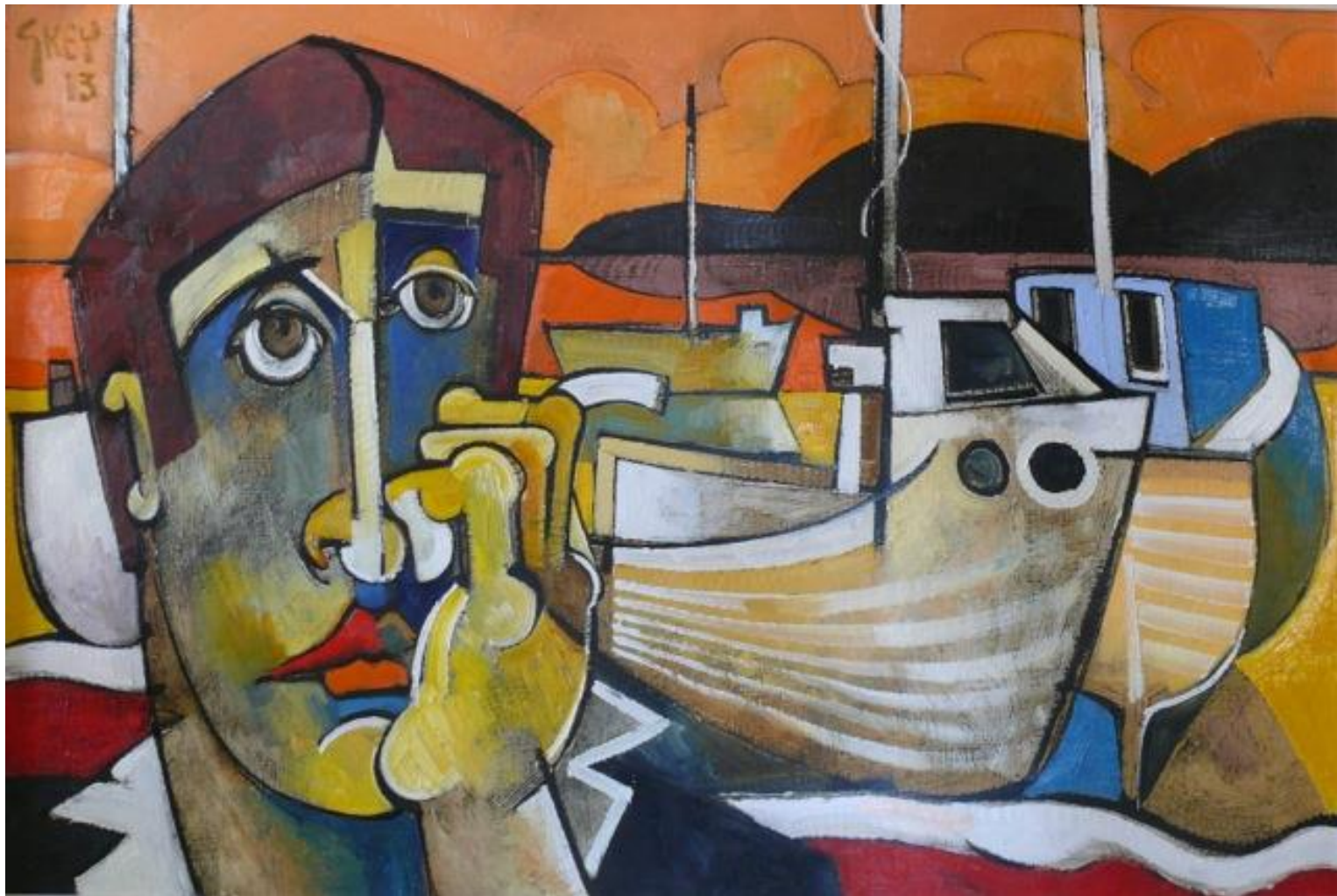
Bay Thinker, Oil on Canvas, 24" x 36"